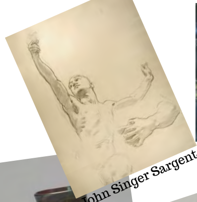
John Singer Sargent